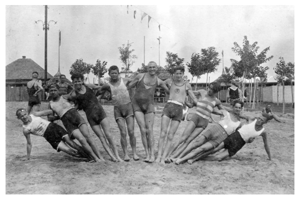
Original fortepan image, "fortepan 25246," by

The ShareAlike condition applies only for works considered adaptations under copyright law, not simply in collections with other works (also referred to as mere aggregations). Therefore, publishing a series of Fortepan images, unaltered, in a book or in an online gallery, does not require a ShareAlike license. For example, take a look at this <u>Fortepan</u> image: