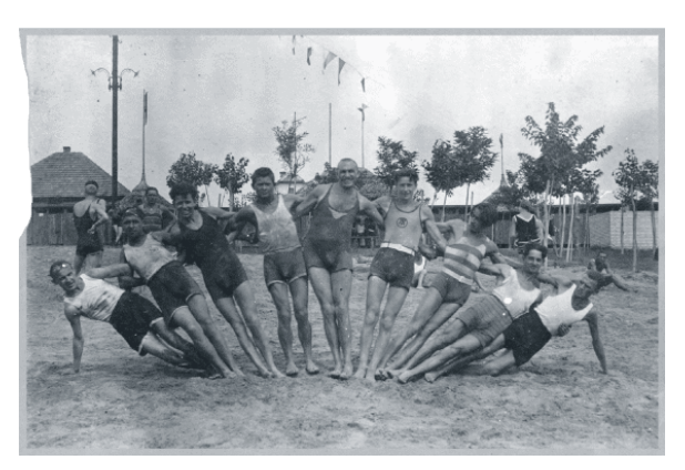
Here is a slightly modified version of the same